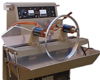
EMCOL GP 3 in Ring Clamping configuration

The head versatility is complemented by drain tray adjustment allowing rings, shafts and other larger components to be tested on this machine.