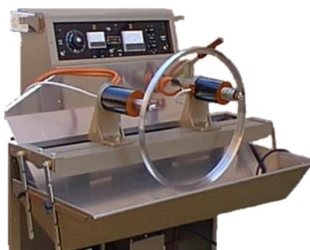
EMCOL GP 3 in Ring Clamping configuration

The head versatility is complemented by drain tray adjustment allowing rings, shafts and other larger components to be tested on this machine.